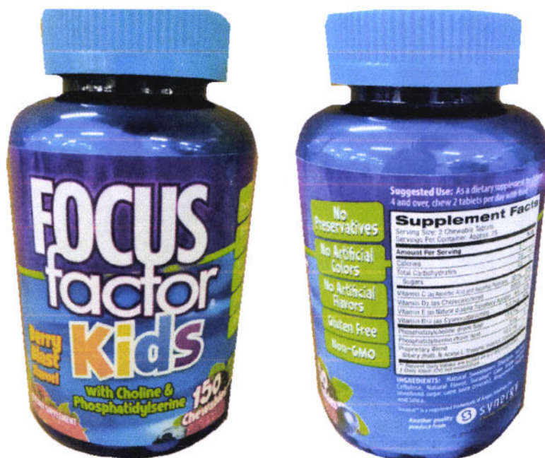
Figure 2. Unregistered FOCUS FACTOR KIDS BERRY with Choline & Phosphatidylserine, in Berry Blast Flavor