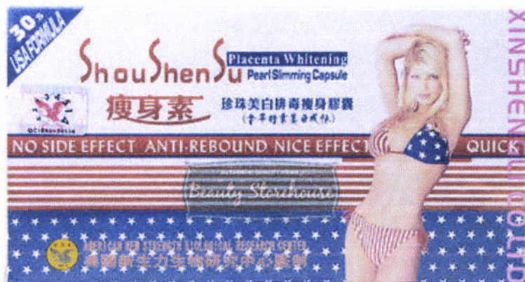
Figure 10. Unregistered SHOUSHENSU Placenta Whitening Pearl Slimming Capsule