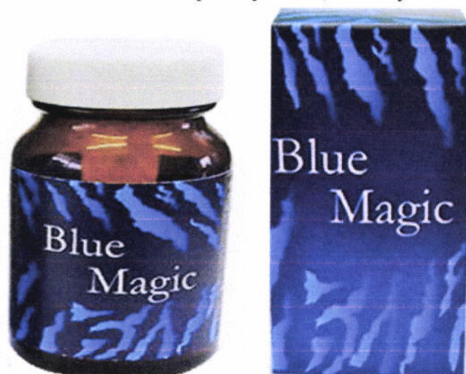
Figure 3. Unregistered BLUE MAGIC Slimming Tablets