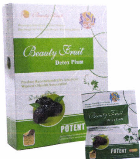
Figure 4. Unregistered BEAUTY FRUIT Detox Plum