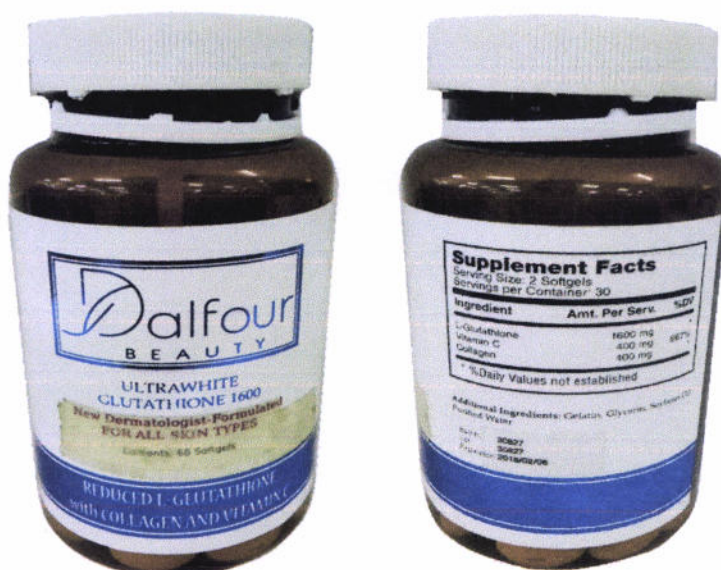
Figure 1. Unregistered DALFOUR BEAUTY Ultrawhite Glutathione

The Food and Drug Administration (FDA) advises the public against the purchase and consumption of the following unregistered food supplements: