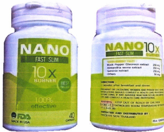
Figure 8. Unregistered NANO Fast Slim Food Supplement