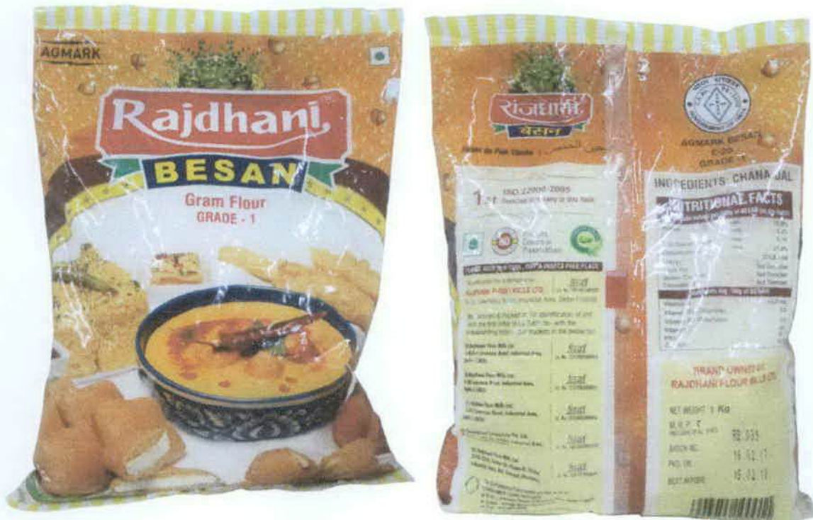
Figure 2. Unregistered Rajdhani Besan Gram Flour Grade – 1 (with no Importer’s Name and Address)

FDA post-marketing surveillance (PMS) activities have verified that the abovementioned flour products have not gone through the registration process of the agency and have not been issued the proper authorization in the form of Certificate of Product Registration. Pursuant to Republic Act No. 9711, otherwise known as the “Food and Drug Administration Act of 2009”, the manufacture, importation, exportation, sale, offering for sale, distribution, transfer, non-consumer use, promotion, advertising or sponsorship of health products without the proper authorization from FDA is prohibited.