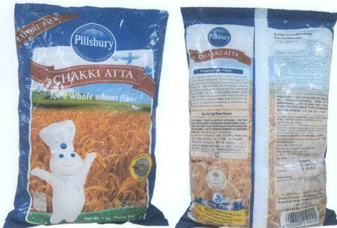
Figure 1. Unregistered Pillsbury Chakki Atta 100% Whole Wheat Flour (with no Importer's Name and Address)

The Food and Drug Administration (FDA) advises the public against the purchase and consumption of the following unregistered and unfortified flour products: