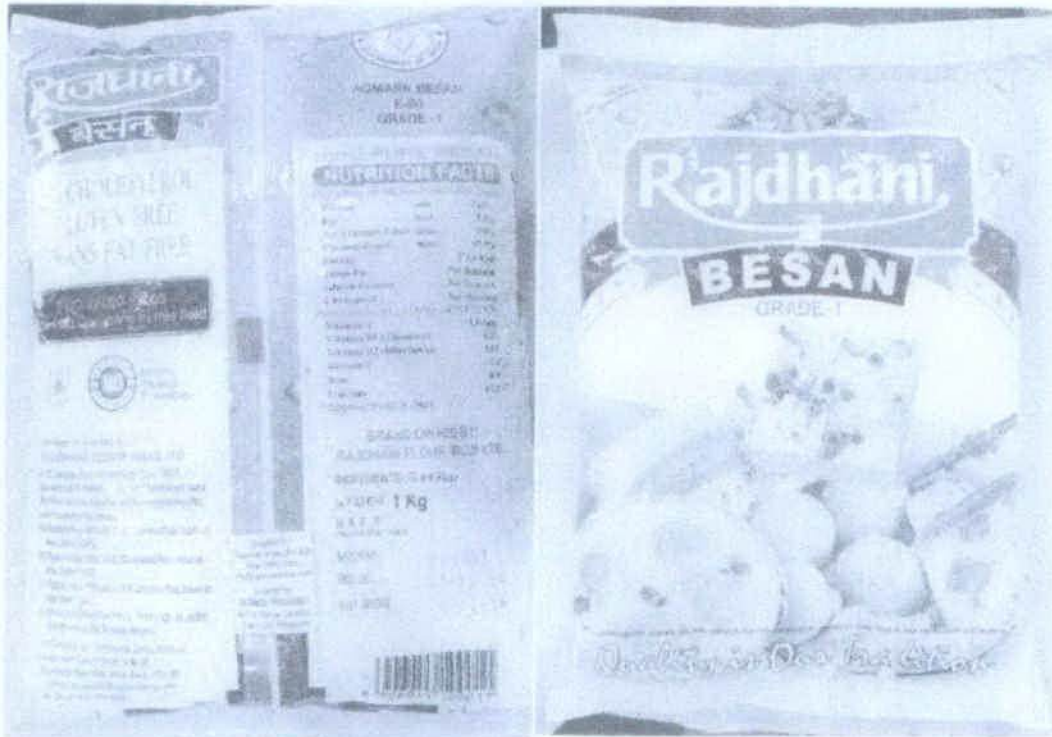
Figure 5. Registered RAJDHANI Besan Gram Flour under the Company Ramsi Trading