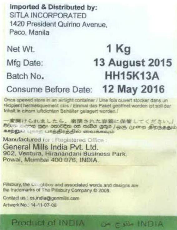
Figure 4. Registered PILLSBURY Chakki Atta Stone Milled Whole Wheat Flour under the Company Sitla Incorporated