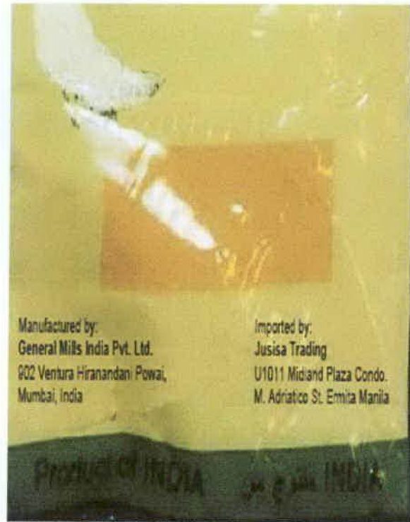
Figure 3. Registered PILLSBURY Chakki Atta Stone Milled Whole Wheat Flour under the Company Jusisa Trading